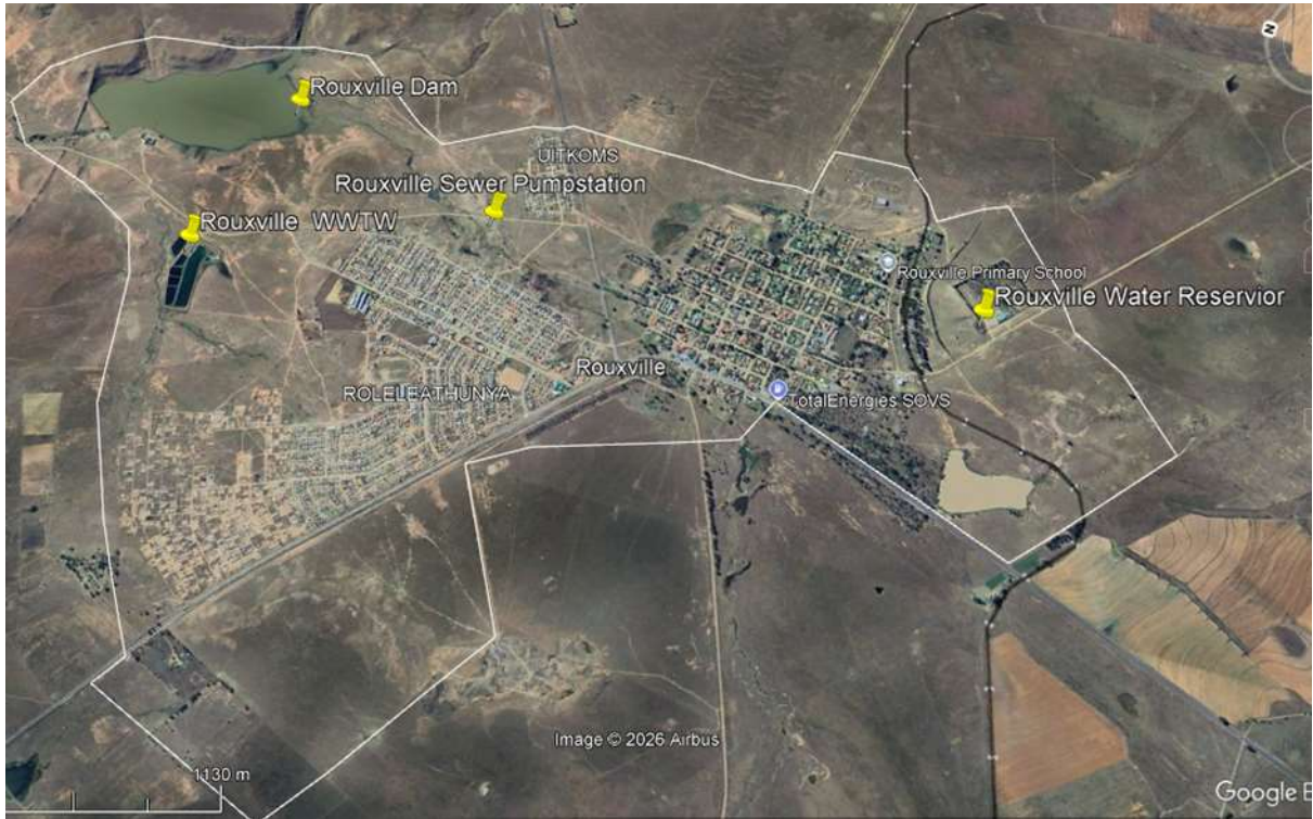
Figure 1: Locality plan